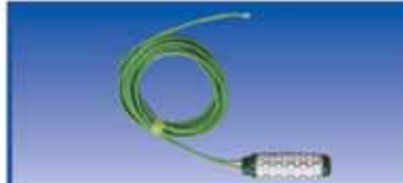
Soil Moisture Sensor