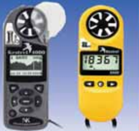
Pocket Weather / Wind Meters