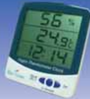
Big Display Thermo-Hygrometer with clock