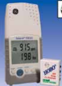
Indoor Air Quality Monitor with datalogger