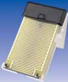
Leaf Wetness Sensor