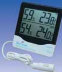
Big Display Thermo-Hygrometer with external sensor