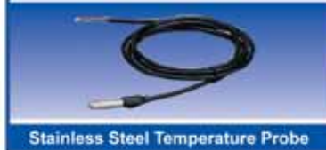
Stainless Steel Temperature Probe